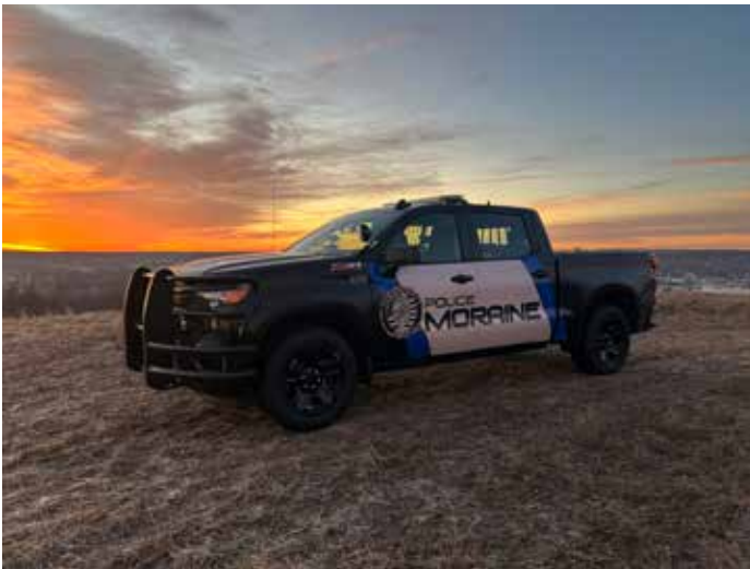
Moraine Police Division will soon have new vehicles entering the patrol vehicle fleet.