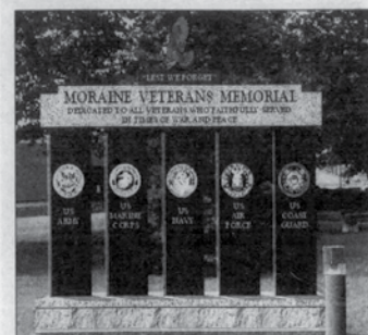
THIS IS A virtual image by Dodds Monuments of what the completed memorial will look like.