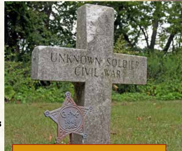
American City & County Magazine recognized a photo taken at Ellerton Cemetery as a snapshot winner in 2005. The picture depicts the grave of an unknown Civil War soldier marked by a cross.