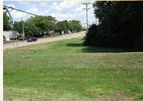
The photo shows where the canal went and where the sandlot baseball field was located.