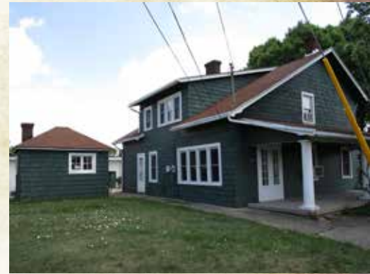
Dryden and Kreitzer Road home which contains the small log cabin

The canal was just west of the toll house. The dried out canal bed served as a small sandlot baseball field in the 1960's and 1970's for the local kids that lived next door in the mobile home court.