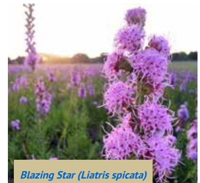
Blazing Star (Liatris spicata)