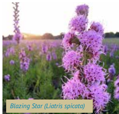
Blazing Star ( Liatris spicata )

A healthy and diverse ecosystem is important for clean air and water, soil stability and provides critical food and shelter for wildlife.