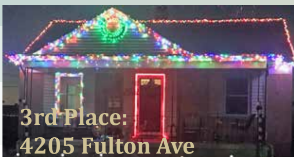
3rd Place: 4205 Fulton Ave