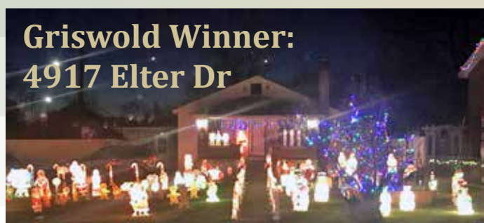
Griswold Winner: 4917 Elter Dr