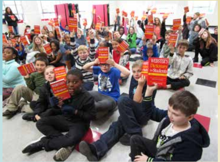
Fourth grade students at C.F. Holliday Elementary School in Moraine received free dictionaries

For information regarding permits, call the Community Development Office at 535-1030.