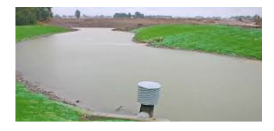
Edition 2006 (updated 11-6-14).

Filter socks are made from inserting compost into a flexible, permeable tube and range in size from 8" to 24" in diameter. Filter socks are appropriate for slopes up to 2:1 (H:V).